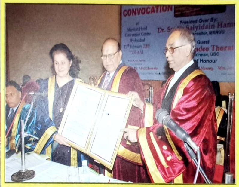
اردو یونیورسٹی کے تیسرے جلسہ تقسیم اسناد کا شاندار انعقاد