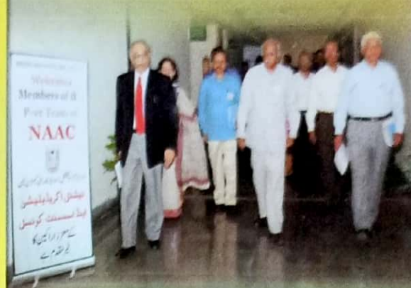
NAAC "A" Grade for MANUU