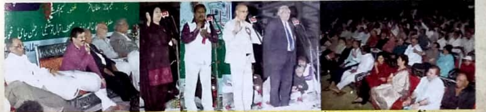
مولانا آزاد پبلسٹری اردو یونیورسٹی کے سبزوہ زار پر منعقدہ گل ہندو مشاعرہ کے میزبان پروفیسر اساتذہ پٹیل اور پروفیسر اساتذہ آندیشہ چیر پرین ناک اسٹریٹجی کینی اور دیگر شاعرانہ دستاویز