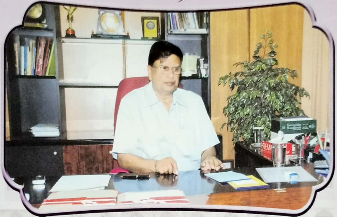
پروفیسر محمد میاں، اردو یونیورسٹی کے تیسرے وائس چانسلر