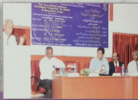
CSSEIP National Conference