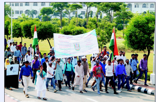
Students participating in the run