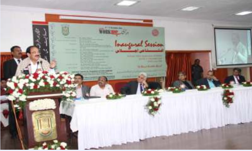
Mr. Venkaiah Naidu is speaking with the students and staff after inaugurating the five-day workshop on Capacity Building of Working Urdu Journalists in Telangana and neighbouring areas

Mr. M Venkaiah Naidu, Union Minister for Information and Broadcasting, today cautioned against “unhealthy” competition in the media and said their power should be used for the social good.