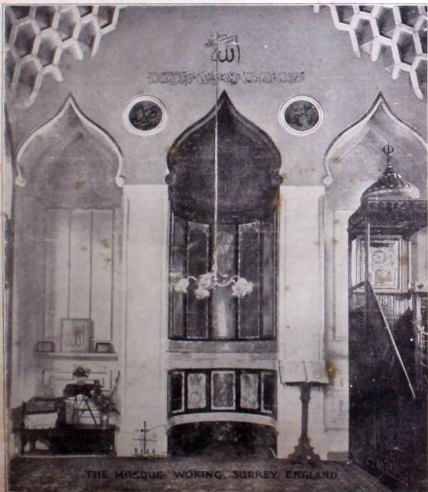
THE MOSQUE WOKING SURREY, ENGLAND.